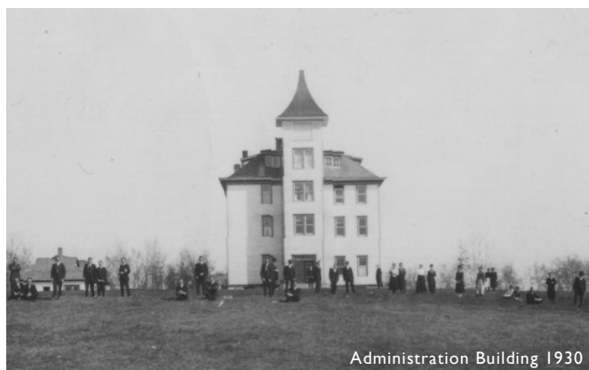
Administration Building 1930

Western Canada experienced unprecedented growth during the first decade of the 20th century. Immigrants from Europe, the eastern provinces, and the United States followed the railroads westward. The growing population made it necessary to organize the territory into provinces. Alberta gained its provincial status in 1905 and two years later a group of Seventh-day Adventist laypersons and church leaders established a school for their youth near Leduc, Alberta. Burman University traces its roots to this first Alberta Seventh-day Adventist secondary school.