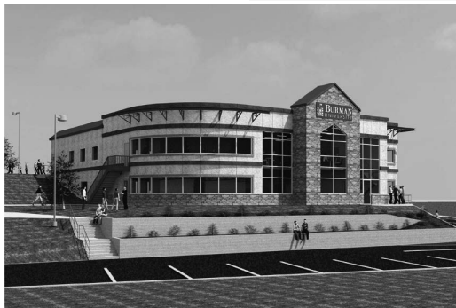
► $5 Million: Library Transformation

Proposed renovated library and learning commons.