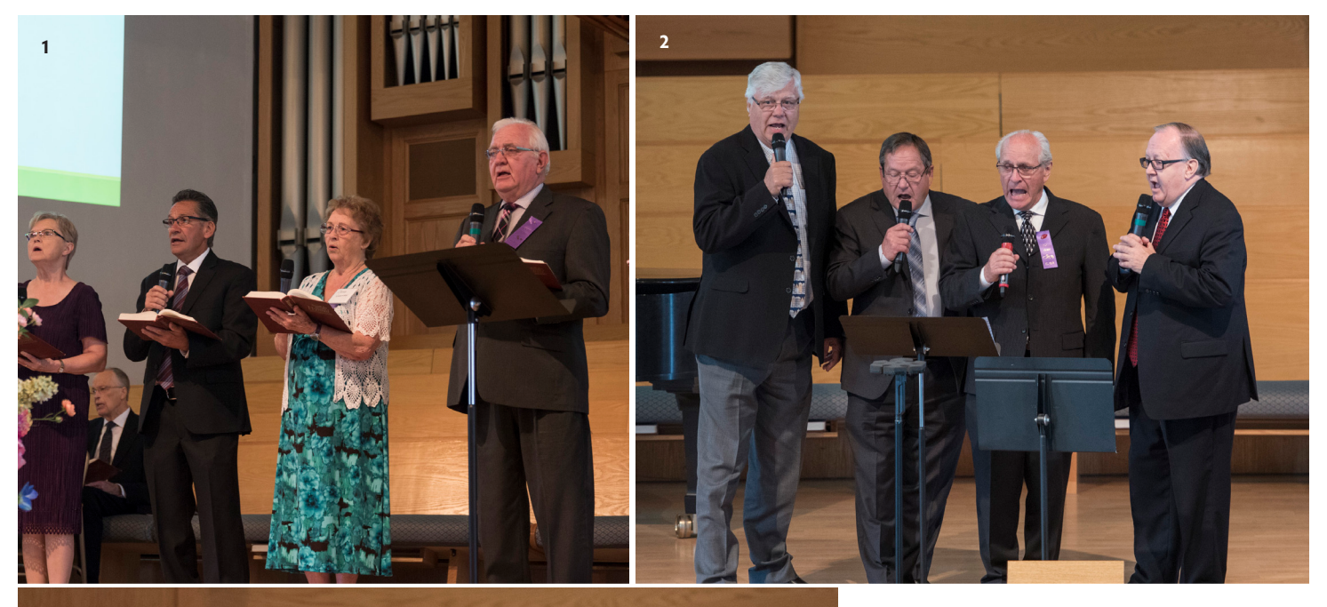
Alumni Homecoming Gallery