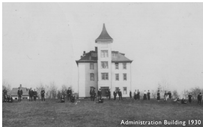
Administration Building 1930

Western Canada experienced unprecedented growth during the first decade of the 20th century. Immigrants from Europe, the eastern provinces, and the United States followed the railroads westward. The growing population made it necessary to organize the territory into provinces. Alberta gained its provincial status in 1905 and two years later a group of Seventh-day Adventist laypersons and church leaders established a school for their youth near Leduc, Alberta. Burman University traces its roots to this first Alberta Seventh-day Adventist secondary school.