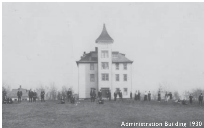
Administration Building 1930

Western Canada experienced unprecedented growth during the first decade of the 20th century. Immigrants from Europe, the eastern provinces, and the United States followed the railroads westward. The growing population made it necessary to organize the territory into provinces. Alberta gained its provincial status in 1905 and two years later a group of Seventh-day Adventist laypersons and church leaders established a school for their youth near Leduc, Alberta. Burman University traces its roots to this first Alberta Seventh-day Adventist secondary school.