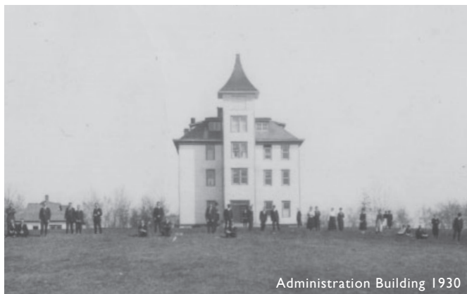
Administration Building 1930

Western Canada experienced unprecedented growth during the first decade of the 20th century. Immigrants from Europe, the eastern provinces, and the United States followed the railroads westward. The growing population made it necessary to organize the territory into provinces. Alberta gained its provincial status in 1905 and two years later a group of Seventh-day Adventist laypersons and church leaders established a school for their youth near Leduc, Alberta. Burman University traces its roots to this first Alberta Seventh-day Adventist secondary school.